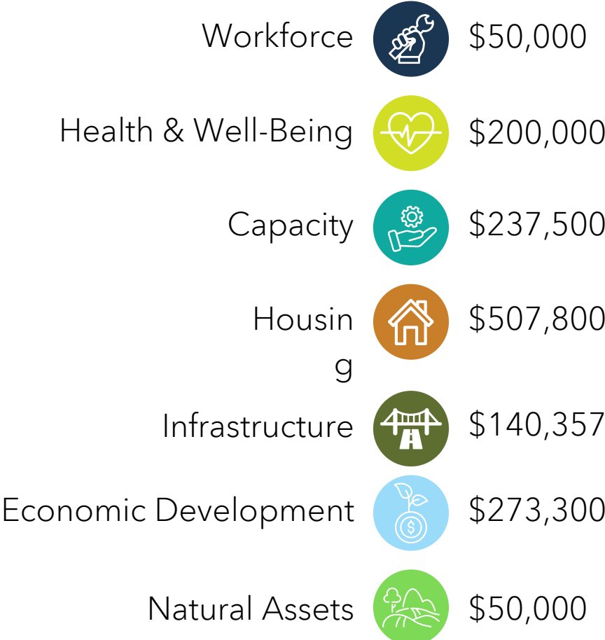
2024 Total Rural Readiness Grant Awards